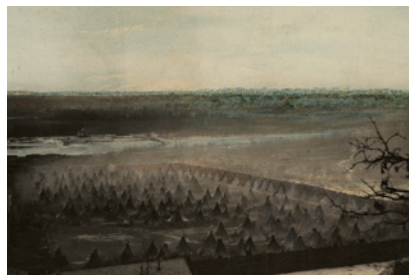
Internment camp at Fort Snelling.