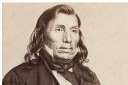
Little Crow, 1862.