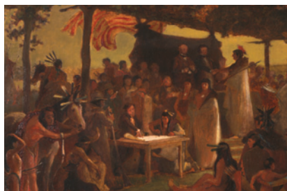
"The Signing of the Treaty of Traverse des Sioux," by Francis Davis Millet, 1905.

High-resolution images are available online at www.usdakotawar.org/media .