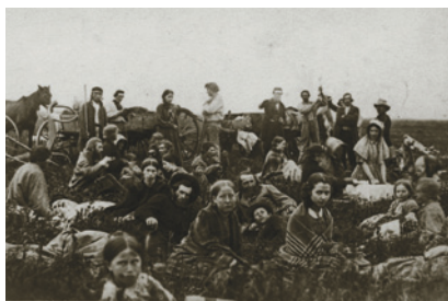
Settlers escaping from the fighting, Aug. 21, 1862.