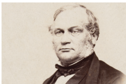
Alexander Ramsey, 1862.