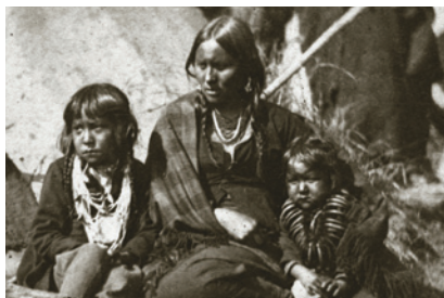
Little Crow's wife and children at Fort Snelling, ca. 1863.