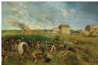
"Attack on New Ulm," by Anton Gag, 1904.