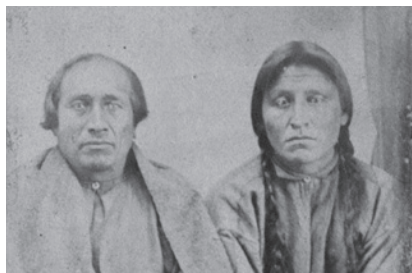
Sakpedan (Little Six) and Wakanozhanzhan (Medicine Bottle) at Fort Snelling, by Joel Emmons Whitney, 1864.