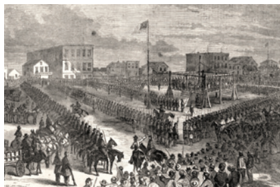
Public execution of 38 Dakota Indians at Mankato, 1862.