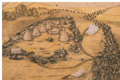
"The Battle of Birch Coulee," Lithograph by Paul G. Biersach, 1912.